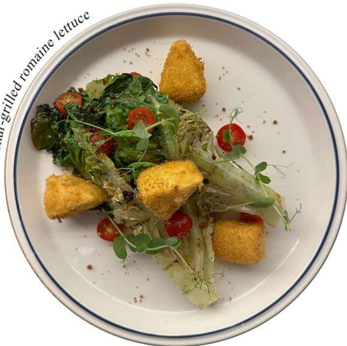
char-grilled romaine lettuce